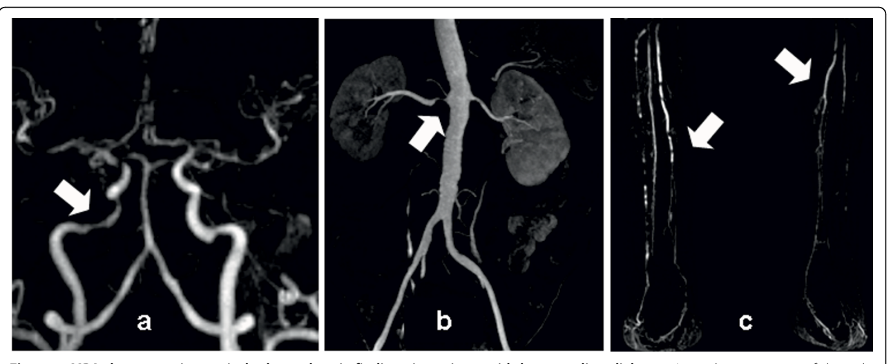
Figure 1 MRA demonstrating typical atherosclerotic findings in patients with longstanding diabetes. A: moderate stenosis of the right middle cerebral artery, B: severe right renal artery stenosis, C: advanced multisegmental bilateral peripheral artery disease.

retinopathy, nephropathy or neuropathy were associated with the score (Table 3).